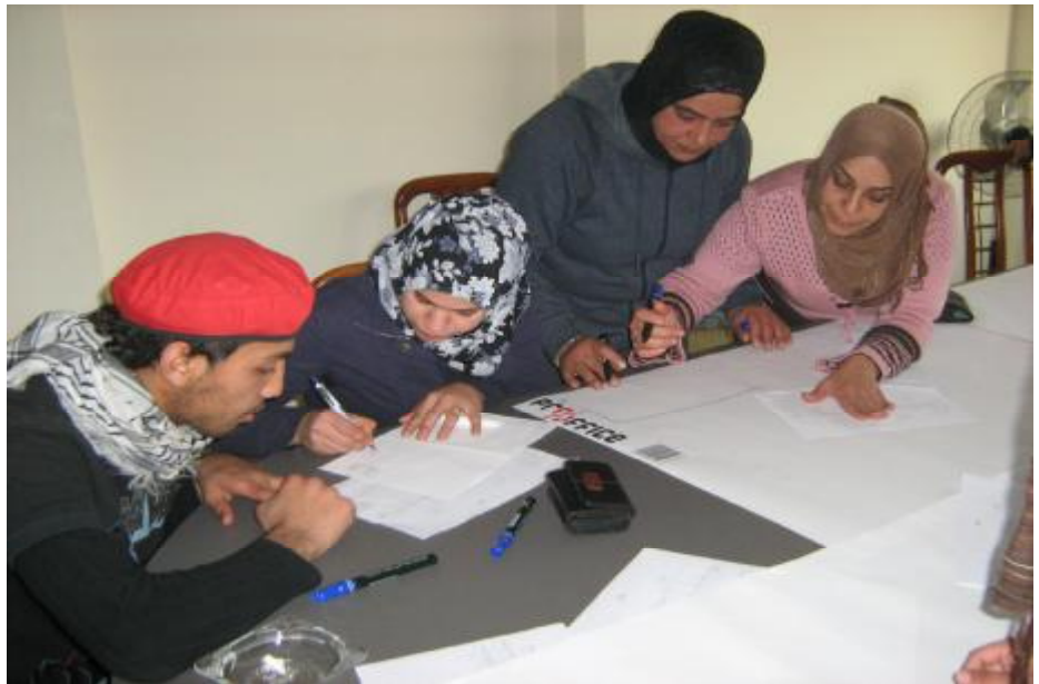
Community representatives in Muhammara & NBC take part in project planning sessions

The entire initiative is part of a joint project “Integrated Approach to the Rehabilitation of NBC Adjacent Area” implemented by UNDP, UNRWA, ILO, UNICEF and UN-HABITAT and funded by the European Commission – Humanitarian Aid department (ECHO). ♦