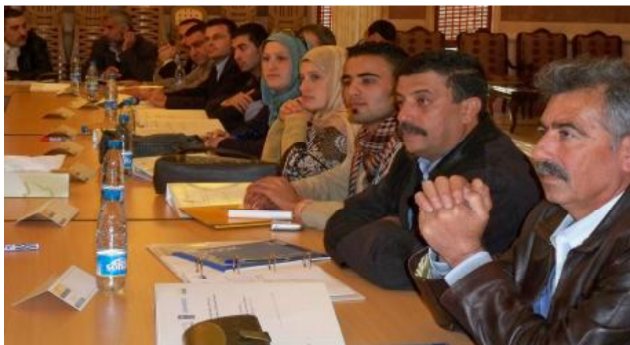
Trainees in the session “Competencies for Local Elected Leaders”

In parallel with the training workshops, on-the-job training activities would be implemented and would include follow up individual meetings and coaching sessions with each municipality. ♦