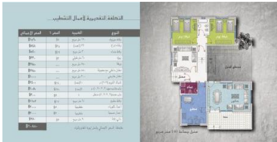
User friendly content to reach affected families in a simple manner

This project component is funded by the Finnish Ministry of Foreign Affairs and is part of UN-HABITAT project “Good Governance for Enhanced Post-War Reconstruction in Southern Lebanon” implemented in cooperation with the three unions of municipalities of Tyre, Bint Jbeil and Jabal Amel, Beit Bil Jnoub organization and the American University of Beirut. ♦