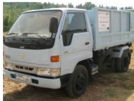
Machineries donated to Muhammara Municipality