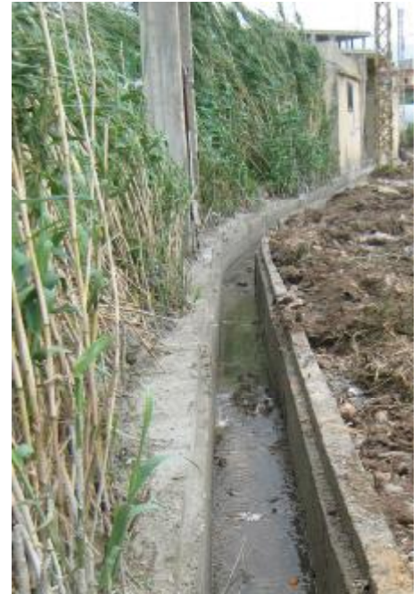
... and after

This action entailed carrying physical rehabilitation works and distributing basic educational equipments to 14