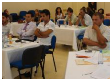
Participants in the working session in AUB

offices in other unions of municipalities. Technical offices could have an instrumental role in promoting municipal decentralization and engaging, in a more effective manner, concerned local authorities in addressing various urban challenges in Lebanon. ♦