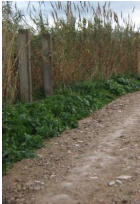
Before the construction of the concrete water channel in NBC sector (B)

The construction of a concrete water channel in NBC - sector (B) reduced significantly levels of pollution caused by the inadequate mixing of the existing