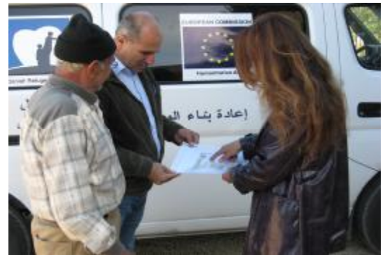
Handing over reconstruction documents