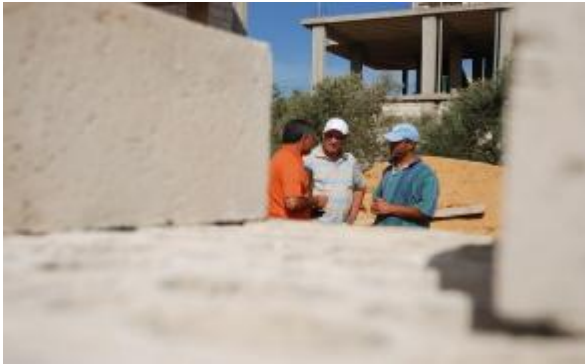
Housing damage assessment