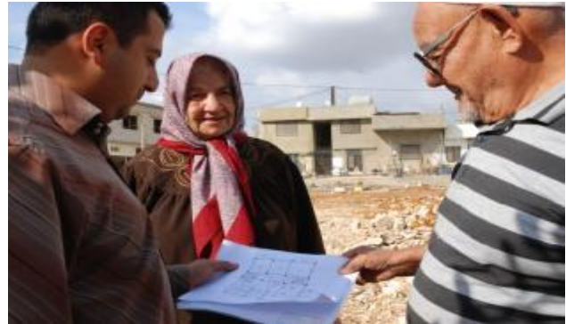
Participation of affected communities in housing design