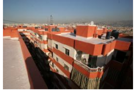
70 Rehabilitated buildings in Hayy El Sullum