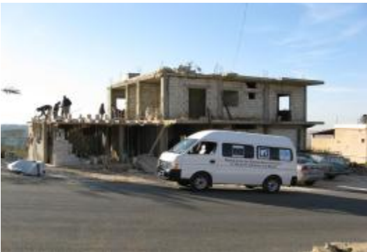
Mobile Unit in the field